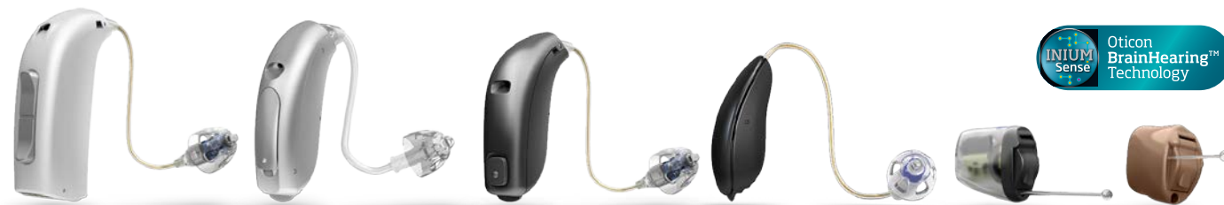
Hearing aids shown in actual size. Available in many different colours.